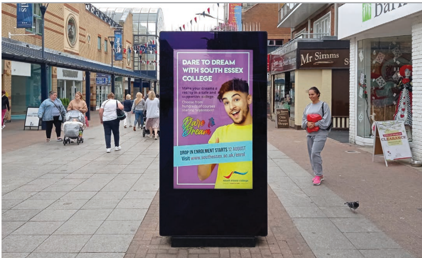
Stunning outdoor totems; perfect for any weather conditions